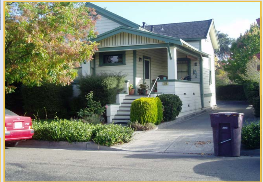
316 Chinn St. Currently rented as a 2 bedroom home and is in excellent condition. Rear of house is paved and provides one covered parking space and additional parking for both Chinn St buildings.

The above information, while not guaranteed, has been secured from sources we believe to be reliable. This is not an offer to sell or lease and is subject to change or withdrawal.