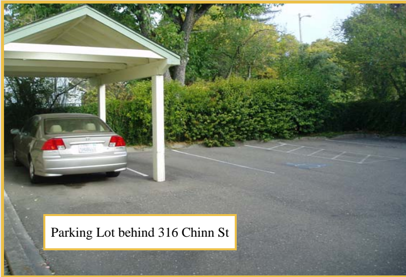
Parking Lot behind 316 Chinn St