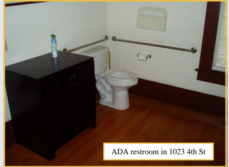
ADA restroom in 1023 4th St