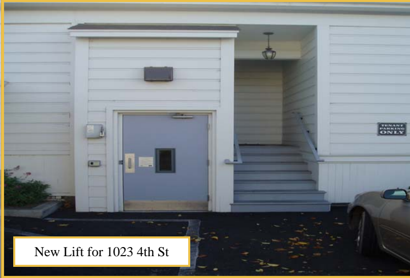
New Lift for 1023 4th St