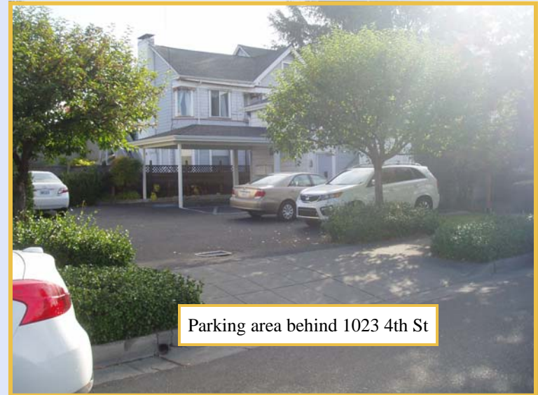
Parking area behind 1023 4th St

The above information, while not guaranteed, has been secured from sources we believe to be reliable. This is not an offer to sell or lease and is subject to change or withdrawal.