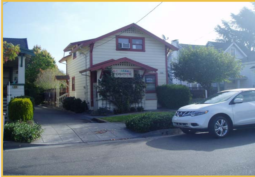
312 Chinn St. Currently rented to Positive Images. Building offers approximately 600 sq.ft of upper and lower level space.