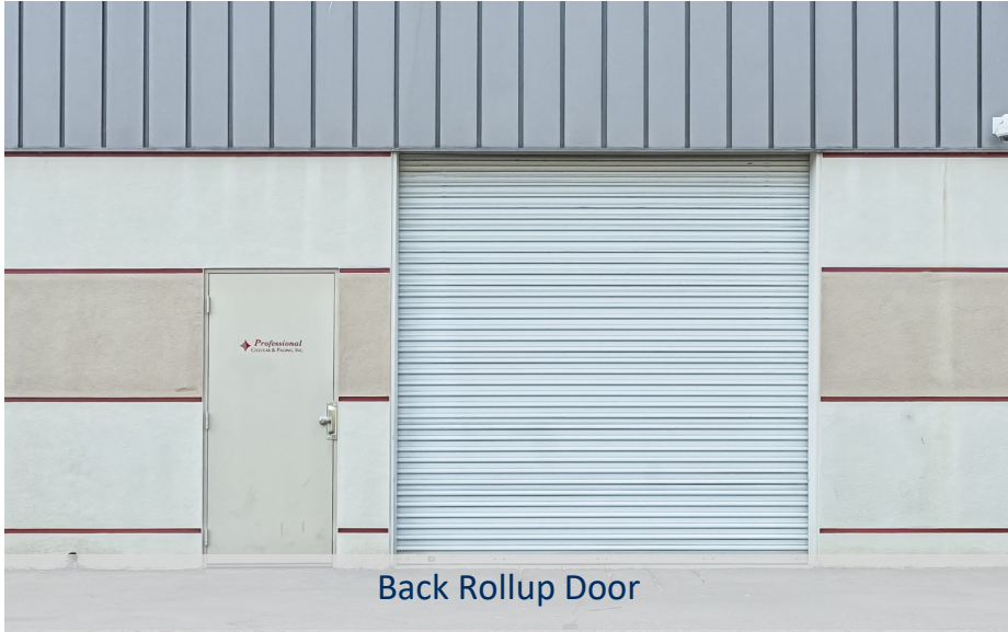
Back Rollup Door