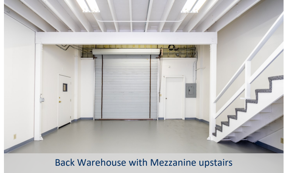
Back Warehouse with Mezzanine upstairs

The above information, while not guaranteed, has been secured from sources we believe to be reliable. This is not an offer to sell or lease and is subject to change or withdrawal. Any interested party should verify the status of the property and the information herein.