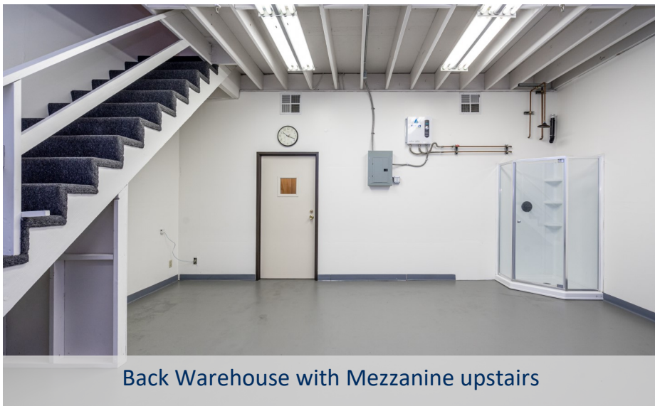
Back Warehouse with Mezzanine upstairs