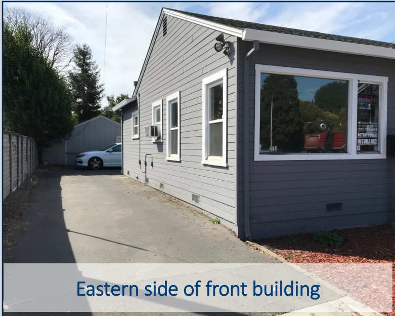
Eastern side of front building