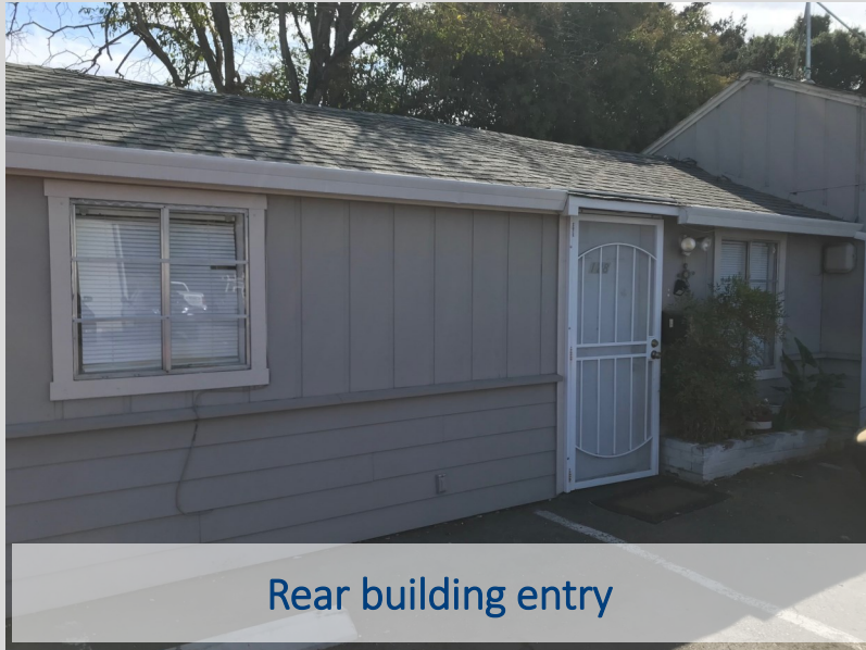
Rear building entry