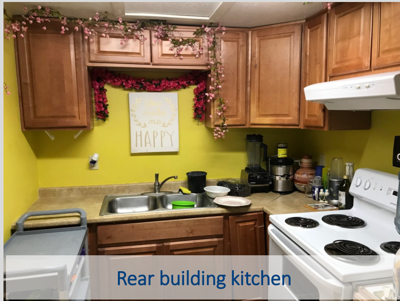
Rear building kitchen