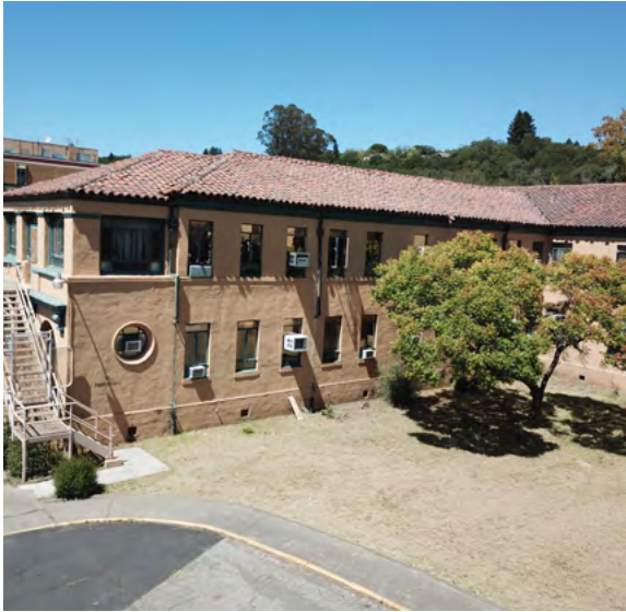
FORMER HOSPITAL SITE ON PARCEL B