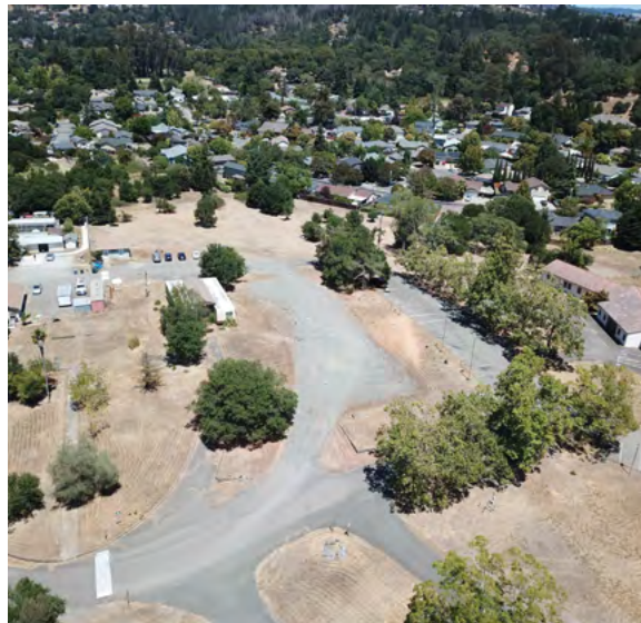
ESTATE PARCEL G WITH ADJACENT NEIGHBORHOOD