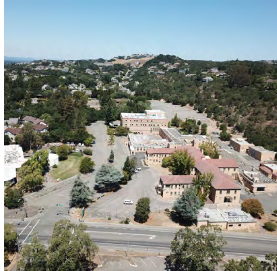
FACING NORTH ON PARCEL A