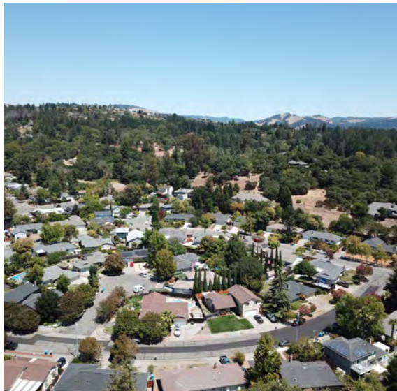
ADJACENT MATURE HIDDEN VALLEY NEIGHBORHOOD